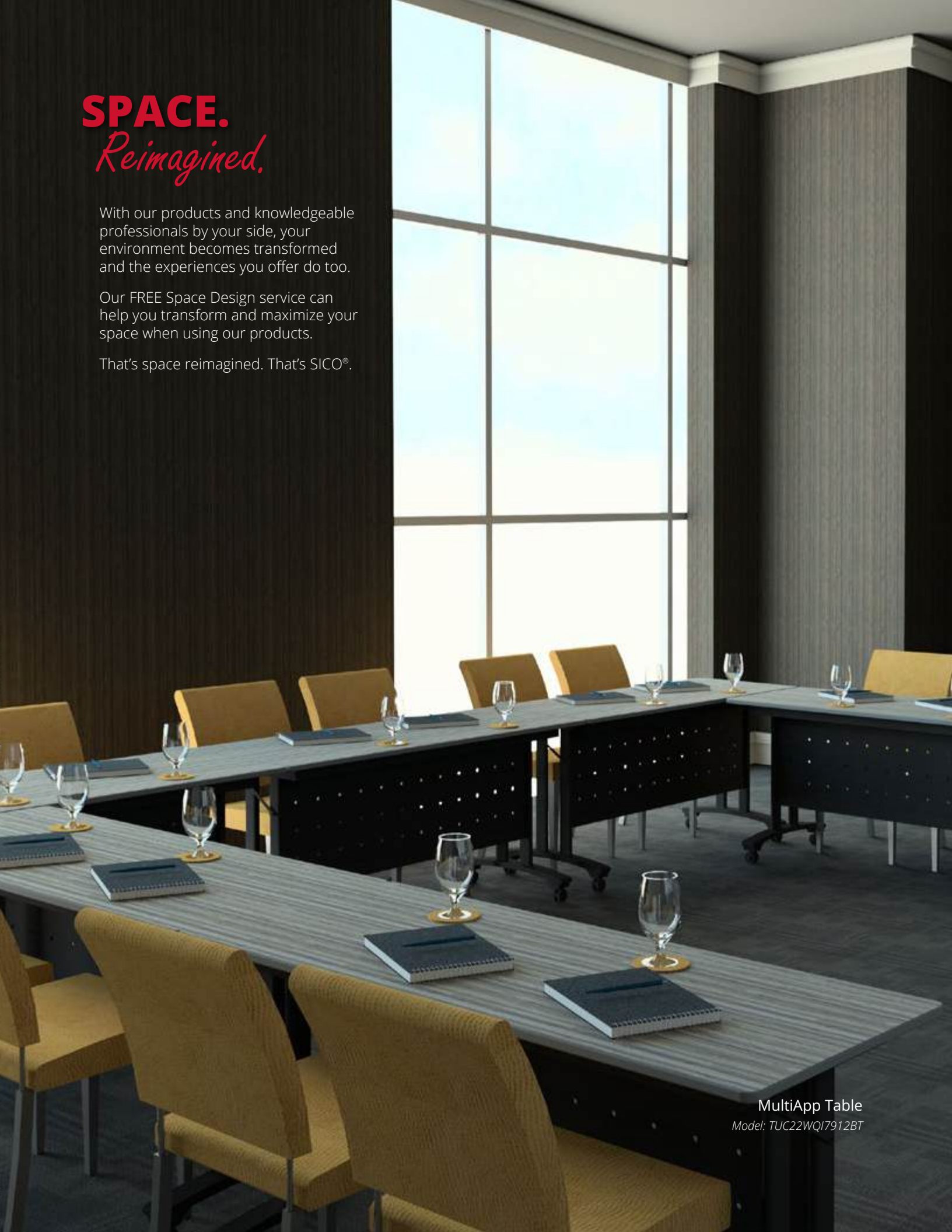
MultiApp Table Model: TUC22WQI7912BT