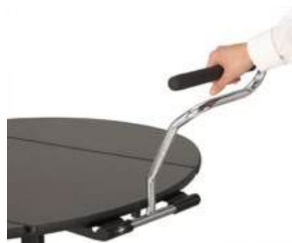
Table Guide (Optional)

Choose a larger 5" resort caster for easy rolling over rough terrain. Constructed for durability and easy cleaning. One person can easily roll and maneuver tables.